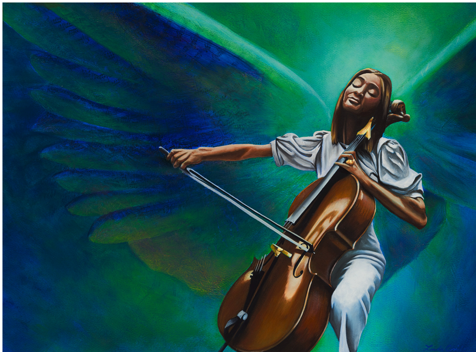
Talking To An Angel - 21x28in - oil - 2024

Each painting is an intimate chapter in a larger, ever-evolving narrative, offering a deep exploration of the creative mindscapes that inspire my work. Straddling the gap between the seen and the unseen, the known and the unknown, my art offers a unique journey through visionary realms, where the mystical interplay of light and color, combined with profound emotional depth, inviting an immersive experience. My work offers viewers a space to reflect, interpret, and connect. Fostering and inspiring conversations that transcend individual experiences.