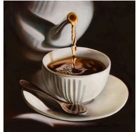
Tea Time - 10x10in - oil - 2023

My visual narratives are rich tapestries woven from personal experiences, dreams, social issues, and contemporary events. My creative process is sparked by intuition, often accompanied by writing, symbols, and personal references, which guide the development of my imagery. Through my practice, I seek to capture not only the physical appearance of my subjects but also their profound emotional depths. This pursuit of emotional resonance is a challenge I embrace, as I strive to convey these subtle nuances.