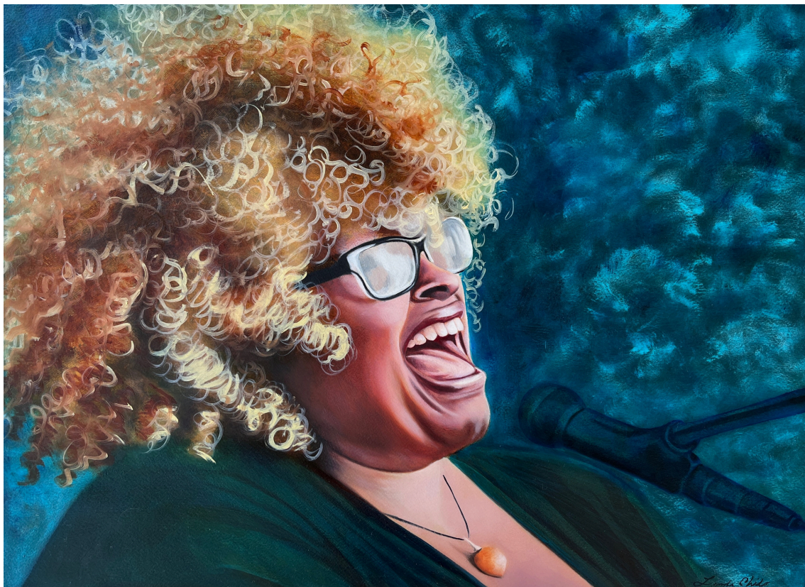
Soul Candi - 20x27in - oil - 2024