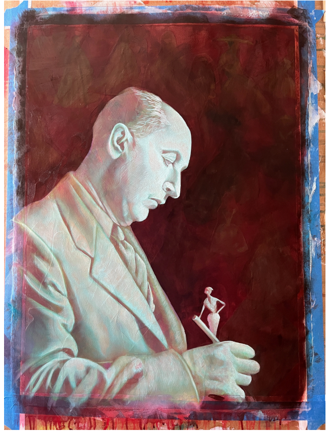
Homage Dior - 28x21in - oil